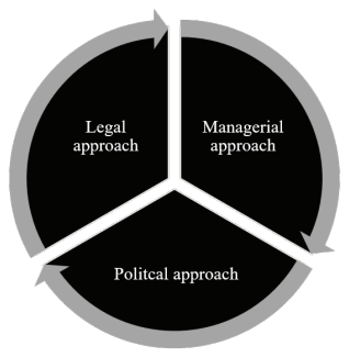
Figure 1. Approaches and Perspectives of MIG

(including the New Public Management or NPM), Political approach and Legal approach